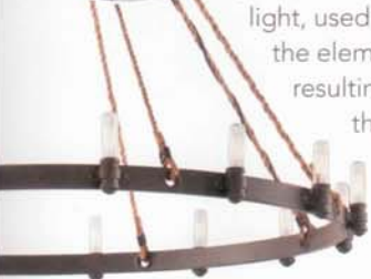
Like Place by Troy Lighting Who knew manila rope and early electric lamps could become a chic chandelier?