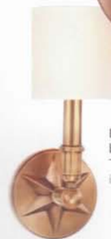
Bethesda by Hudson Valley Lighting® This classic American style sconce in aged brass has pure star quality.

"In recent projects and industry events, I am seeing a trend toward the use of warmer metals and a more refined design. A couple of years ago, clients were looking for sleek chrome or rustic oil rubbed bronze. Now, brass and muted gold are better suited to a softer, more sophisticated, design."