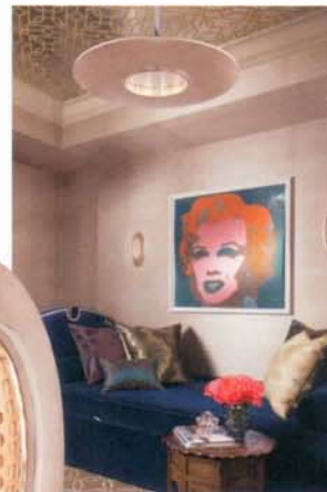
Quasar by Corbett Lighting A bronze trim, textured lens and high-powered LED collide for a warm burst of light.

"Recent advances have led to new LED lights with a warm, soft glow suited to residential applications. Since fixtures no longer need to be designed around relatively bulky incandescent bulbs, we are seeing beautiful new sculptural fixtures that can take new shapes and easily conceal the much smaller LED light source."